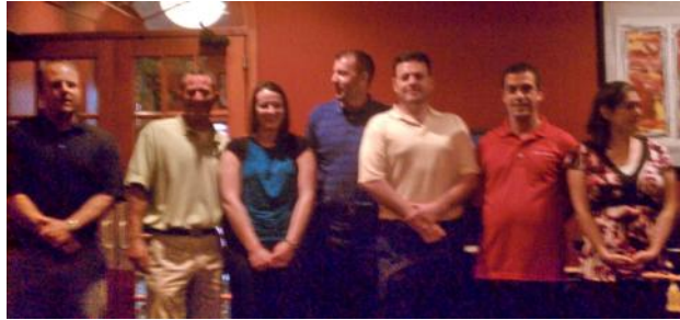
Most of the new board picture

A big thank you goes out to all of this year's board members. We are all looking forward to a great year with the new board and want to wish a warm congratulations to all new board members.